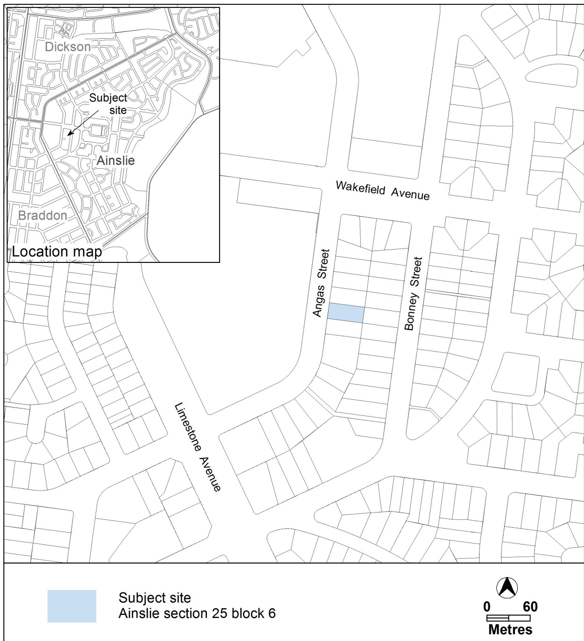
Figure 1 Location map

The subject site is Ainslie section 25 block 6 and is zoned Residential RZ1 Suburban. The block is flat and rectangular shaped, with an area of 1090m 2 and a frontage of approximately 22m to Angas Street. The site possesses unimpeded northern exposure, no significant trees in the construction zone and a driveway in the south-western corner. The block is close to local shops, community facilities, and public transport options including walking distance to the MacArthur Avenue light rail stop. The block currently contains a single storey residential dwelling.